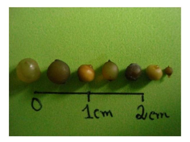
Fig. 2: Cocoons of P. corethrurus, O. beatrix, D. assamensis, M. houlleti, E. comillahnus, D. papillifer papillifer and D. affinis (from right to left).