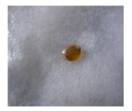
(a) M. houlleti

Recent SEM studies by Chaudhuri and Datta (2020) showed that emergence of juveniles occur through the broader terminal end with a crown shaped structure which is characterized by less concentration of silicon and high concentration of oxygen and nitrogen. In the middle zone of the cocoon, silicon remains as silicate (polymer) that inhibits the exit of juveniles. The porosity of the cocoon allows respiration of embryo inside (Edwards and Bohlem 1996).