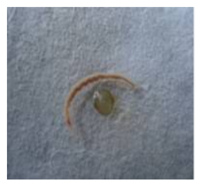
(b) D. papillifer papillifer