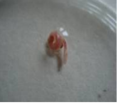
(d) D. affinis