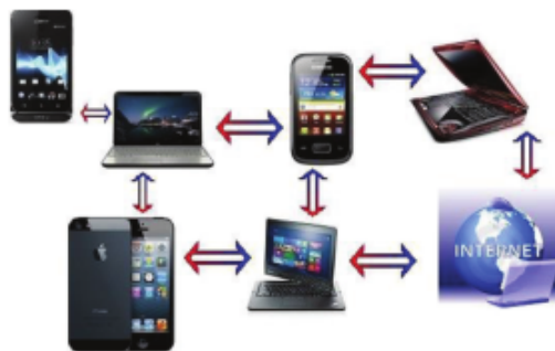
Figure 3.2: Example of sample Mobile Ad hoc communication system