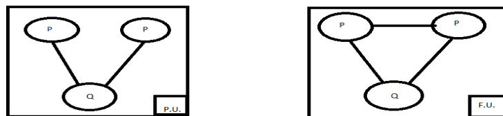
Figure-09: A partially unified perspective (P.U) and a fully unified perspective (F.U.)

The projectability argument against partial unity view shows how one faces insurmountable difficulty in projecting oneself into a partially unified perspective. Faced with such challenge Hurley maintains that such difficulties do not prove that the concept of partially unified perspective is incoherent. She contends that introspection can gain access only to the contents of experiences. Moreover, the subjective perspective, she continues, does not provide us with any clue to the distinction between partially unified perspective and fully unified perspective. In other words, the contrast between unity and its absence is not introspectively discernible. In order to bring out the main thrust of Hurley’s argument Bayne presents Hurley’s argument in the following way. 7