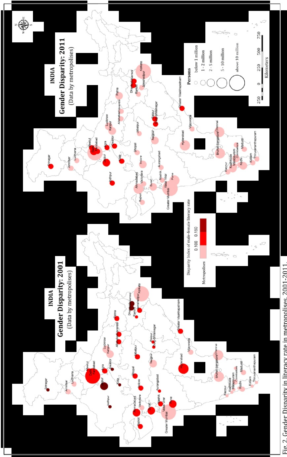
Fig. 2. Gender Disparity in literacy rate in metropolises, 2001-2011.