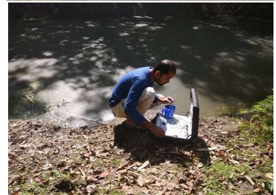
Measuring Water quality through water analyzer kit