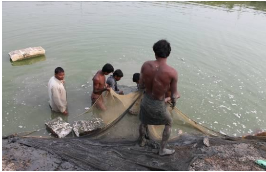
Fish farm in Nandakumar