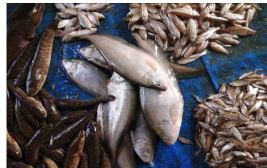
Balighai Fish market