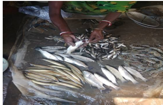
Egra Bazar Fish market