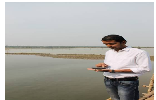
GPS Survey For Ground Truthing