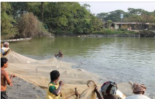
Fishing in Moyna Area