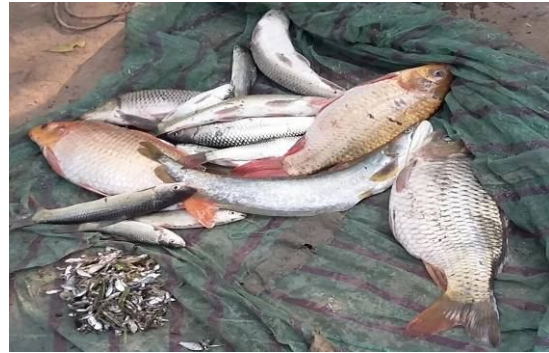
Fishig in Patashpur