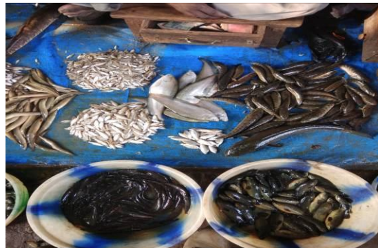
Mecheda Fish market