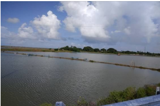
Fish farm in Mandarmoni