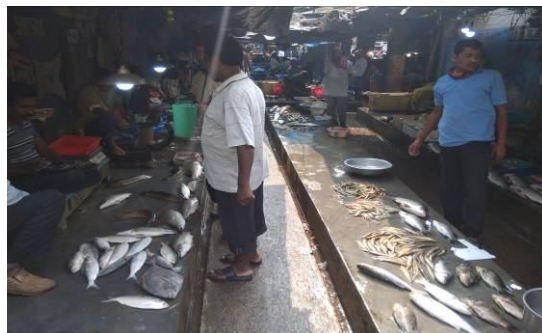
Contai super market