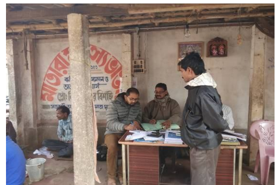
Egra Fish market