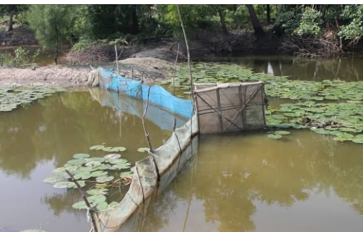
Small Fish pond in Contai Area