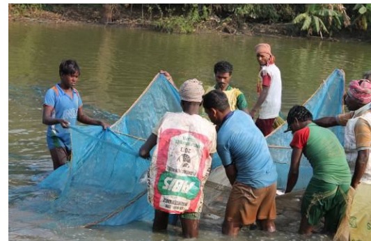
Fish farm in Moyna Area