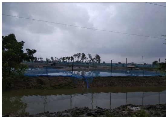
Fish farm in Contai Area