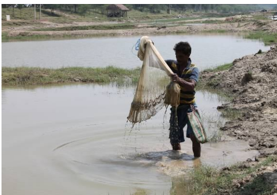
Fishing activity in Junput area