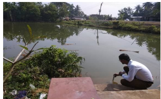
Water Sample Collection