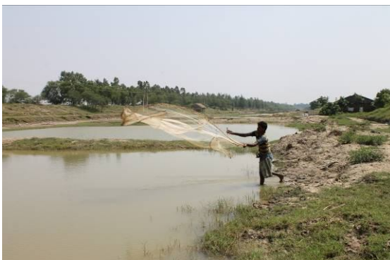
Fishing activity in Junput area