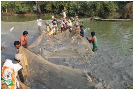
Fishing in Moyna Area