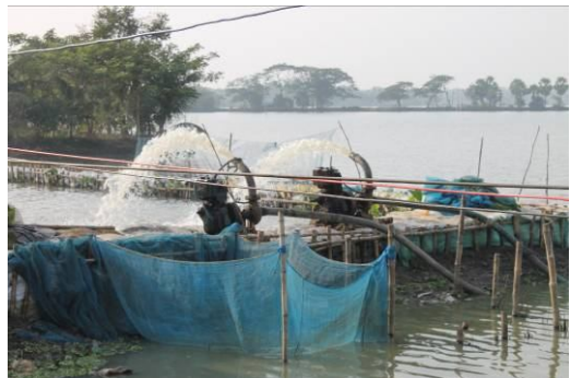
Fish farm in Tamluk Area