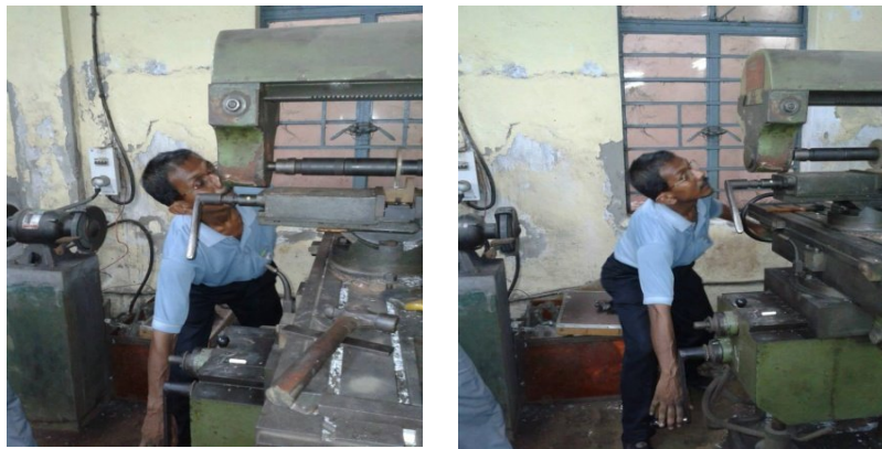
Fig 2: Vertical feed given by rotating the vertical transverse handle

So as per the RULA method a score of 7 indicates immediate investigations and changes.