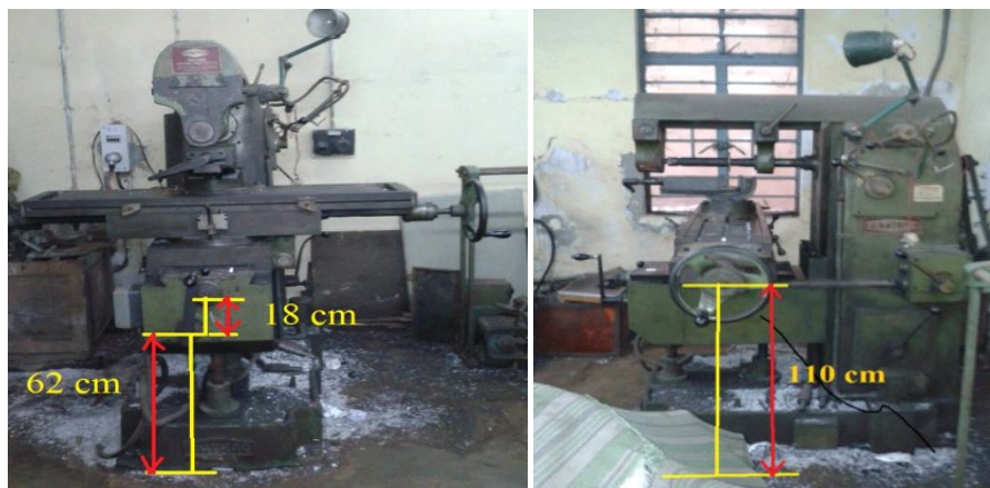
Fig 3: Side and front view of standard milling machine showing the required dimensions

The vertical transverse handle may be raised to the elbow level of a standard Indian man. Average elbow height of Indian male is 103.8cm and that of an Indian female is 95.6cm. The height of the vertical transverse handle pivot is 62cm of the subjected milling machine in the laboratory and the height of the table is 110cm. The rise in height of the vertical transverse handle is suggested. But, the height of the table is suggested to be kept the same or if possible a little bit lowered so that it suffices the purpose of keeping the feed handle height to be at the elbow level as the feed by the feed handle is equally important. The feed handle along with the table is 110cm high from the ground. A slight rise might be allowed as this machine can be given automatic feed as well, where the need for manual feed is omitted. The vertical transverse handle, which cannot be automatically controlled, should be raised to an approximate height of 95.6-103.8 cm. The machine is not proving to be ergonomic as this vertical transverse handle that has to be controlled manually is at a very low and inconvenient height compared to the average elbow height of an Indian giving rise to high posture scores. So raising the height of this handle might prove to be helpful.